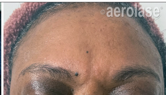
7 Days After