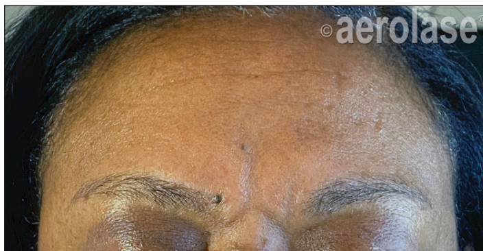
Before 2nd Treatment